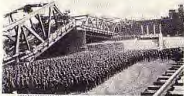
VICTORY BRIDGES DEDICATION